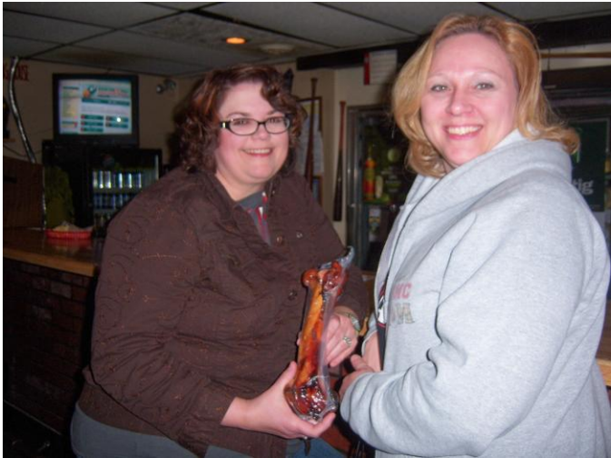
Team Just Us took home the "Give a Dog a Bone" prize at the CCHS Pub Quiz.