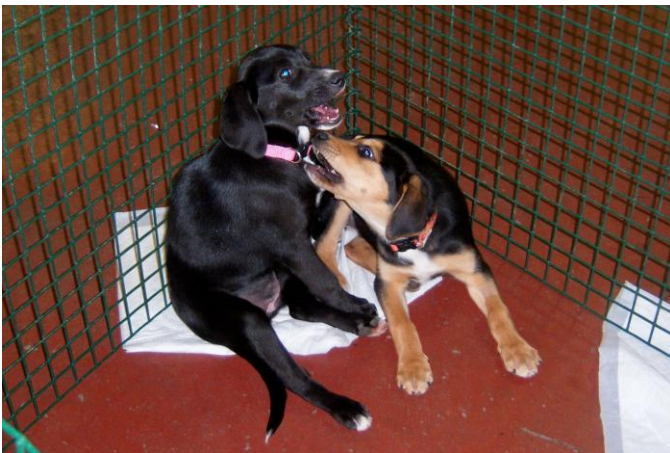
Zelda and Asia do a little puppy wrestling in the playpen at the Meet and Greet.